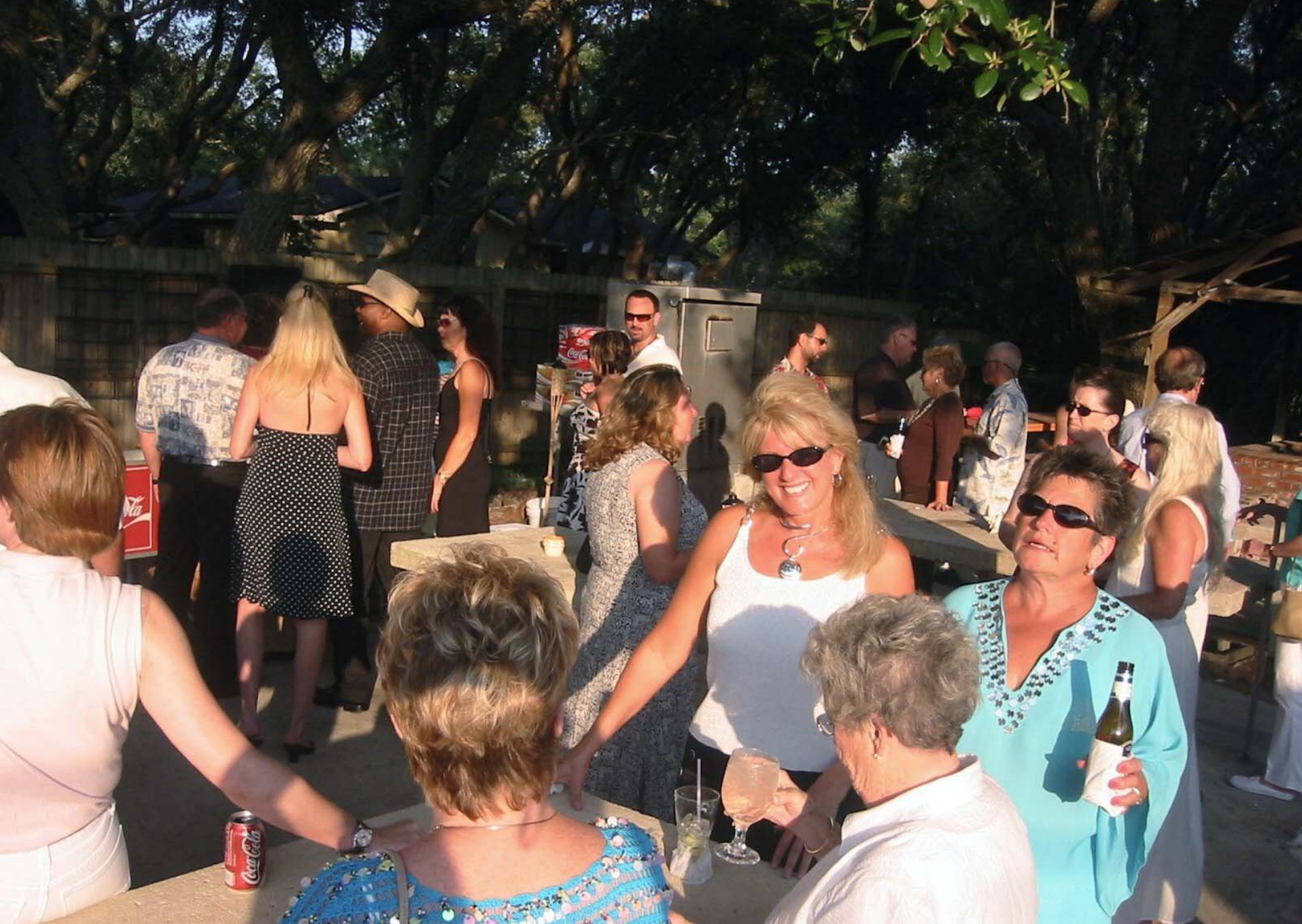
The bar outside – a beautiful evening for an outdoor event!