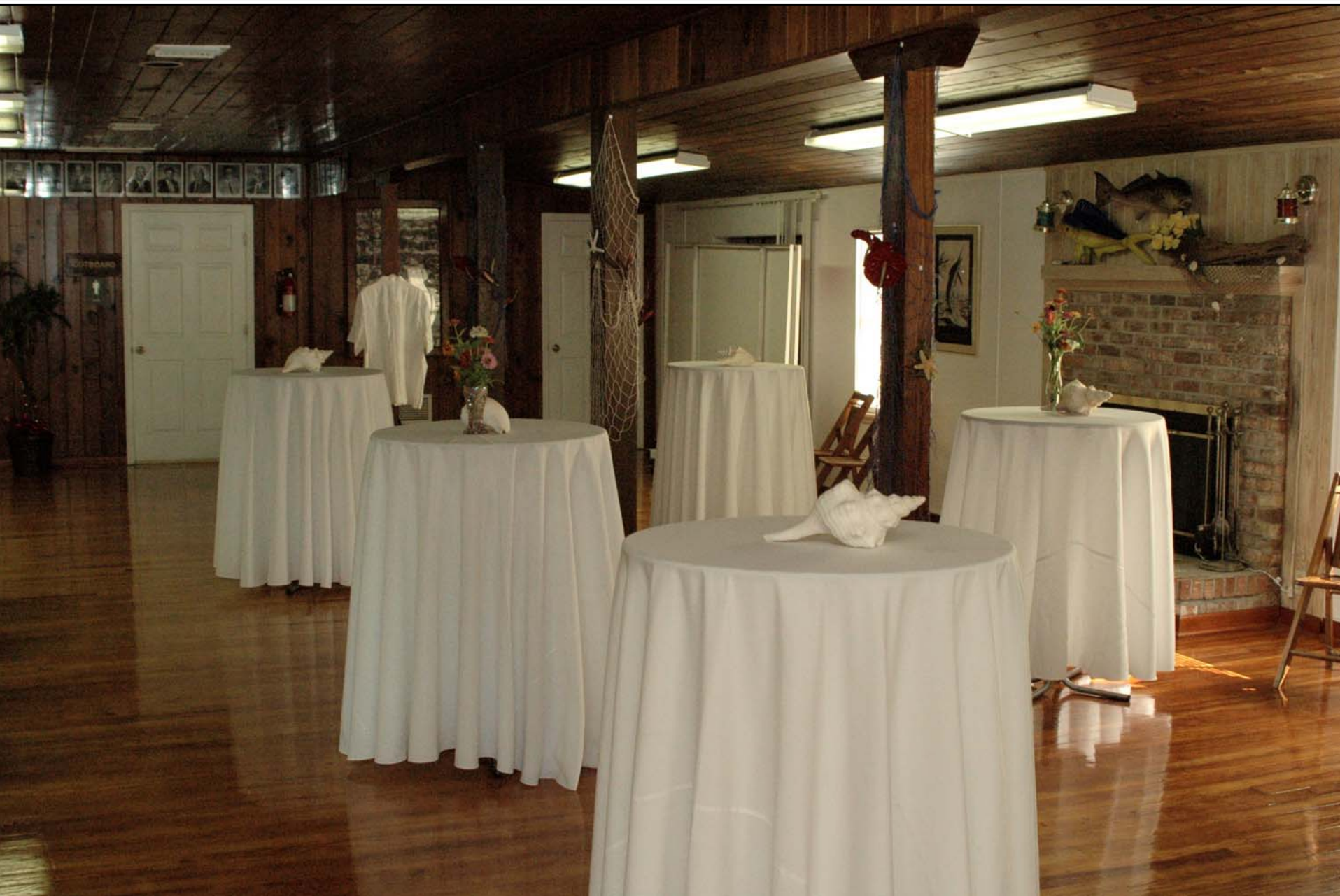
The Boating Club with the island decorating theme