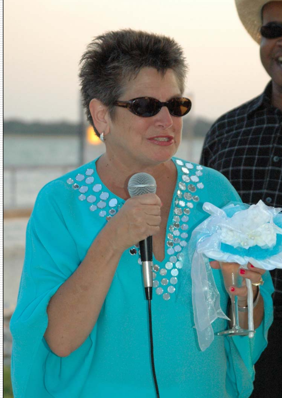
Kaye wishes us well