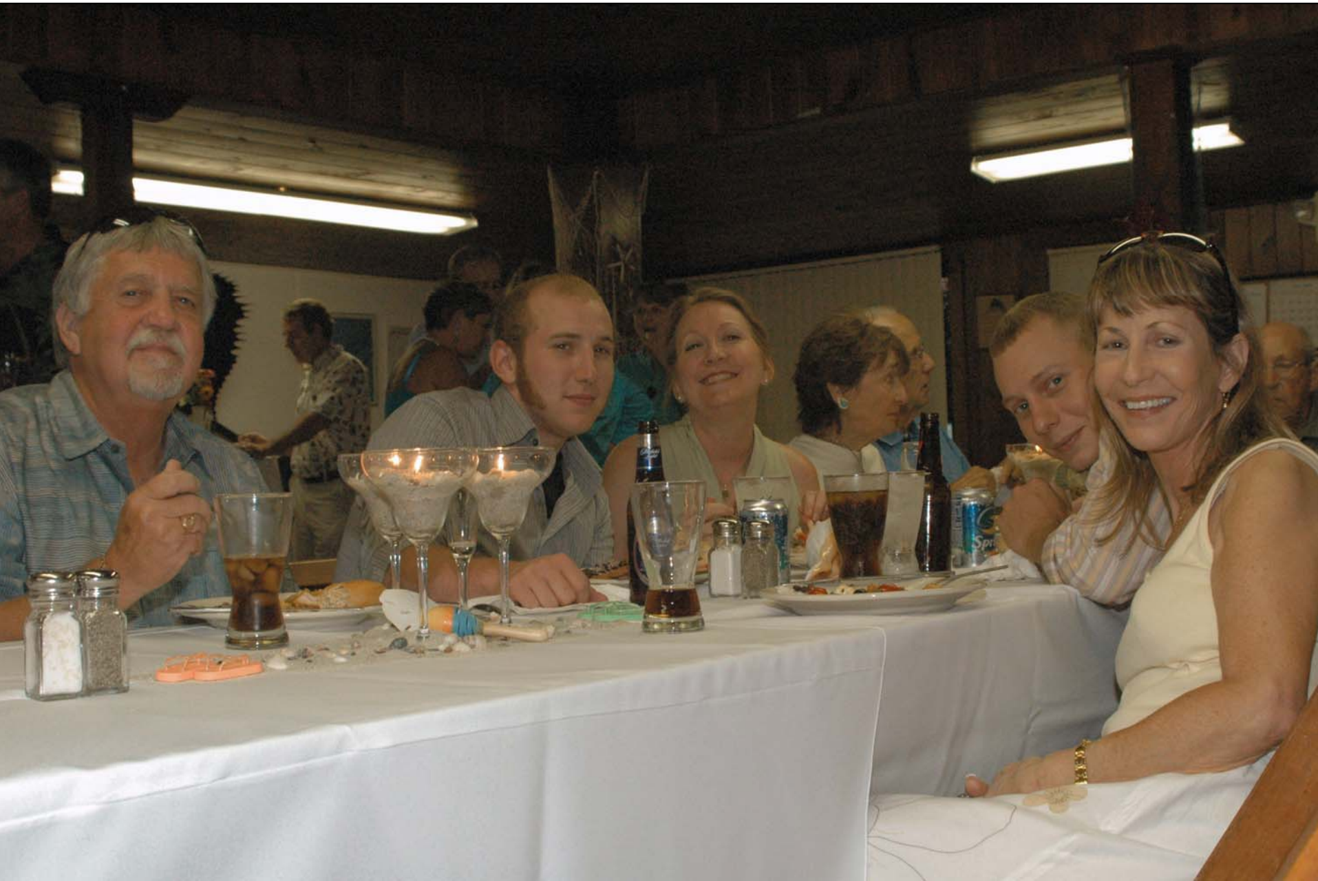
The Hagel clan