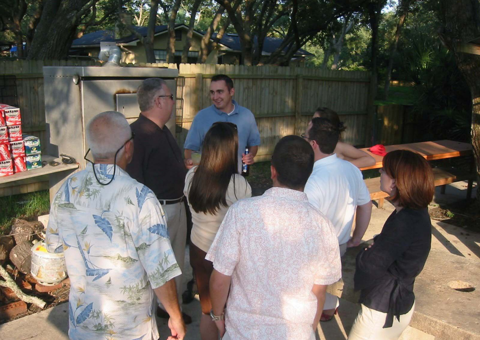
The Moody clan enjoying the evening