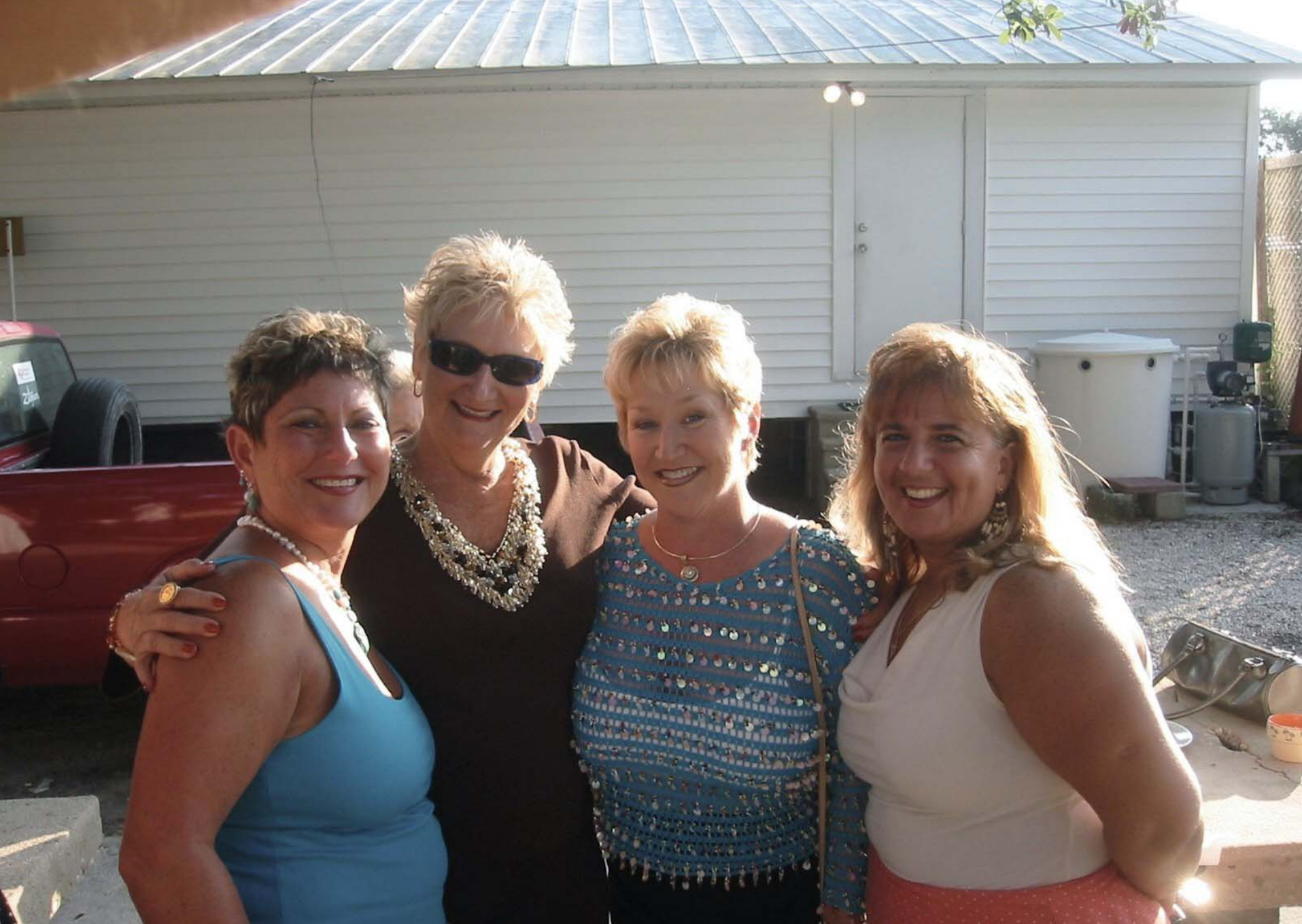
Robin catching up with some friends